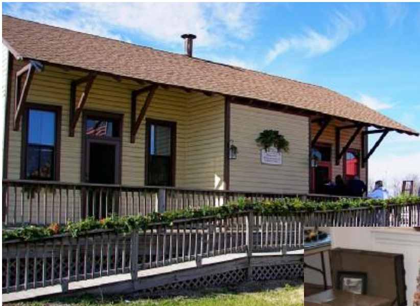
Above: The La Plata Train Station, all decorated for the holidays by members of the La Plata Community Garden Club.