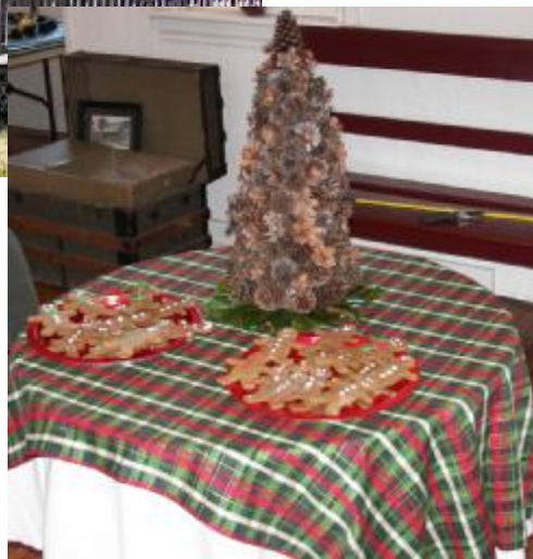
Right: A few tasty treats are left on a plate inside the station for the enjoyment of Santa and/or